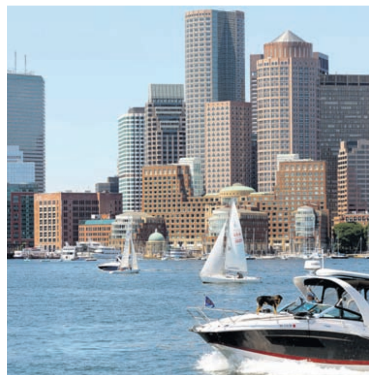
Boats navigate on Boston Harbor, Saturday, July 18, 2020, in Boston.